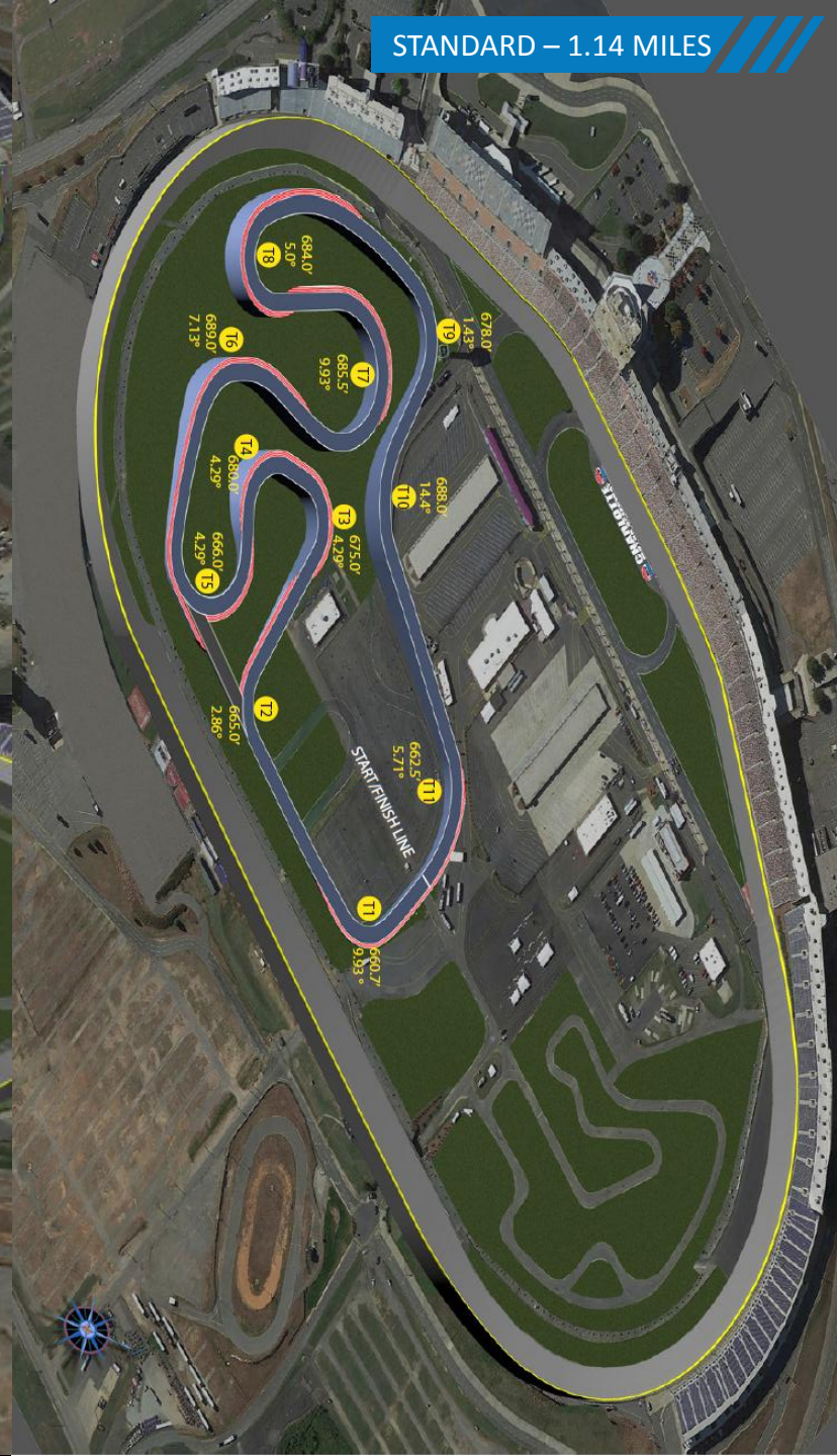
STANDARD – 1.14 MILES