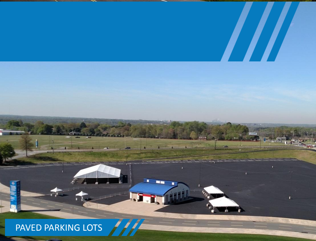
PAVED PARKING LOTS