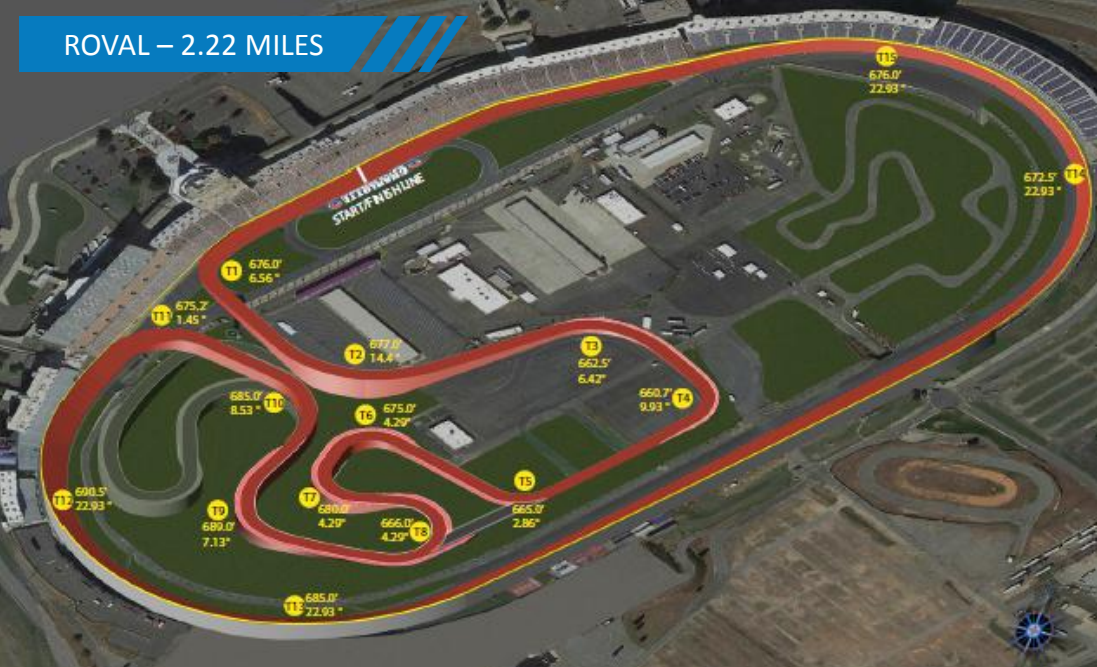
ROVAL – 2.22 MILES