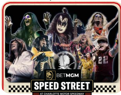
HAIRBALL MAY 23