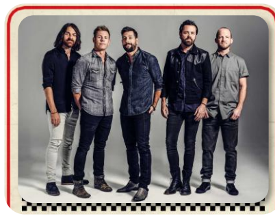
OLD DOMINION MAY 25