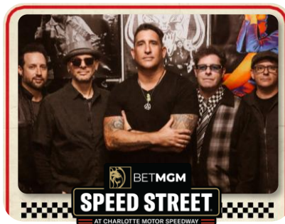
SMASH MOUTH MAY 24