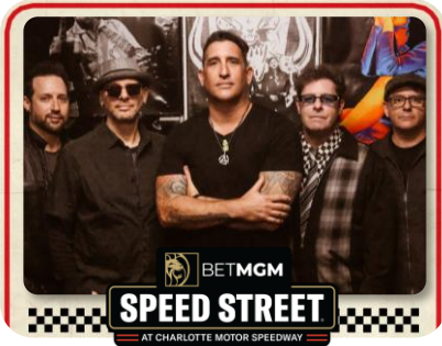
SMASH MOUTH MAY 24