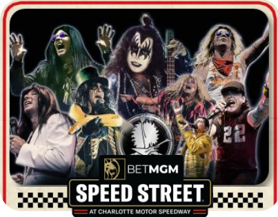
HAIRBALL MAY 23