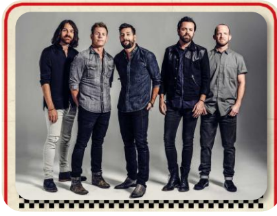
OLD DOMINION MAY 25